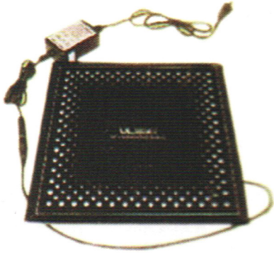
Digital Deactivator Pad