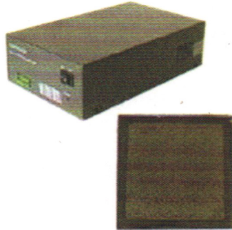
Digital Deactivator Pad