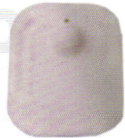
Big Hard Tag 8.2MHz