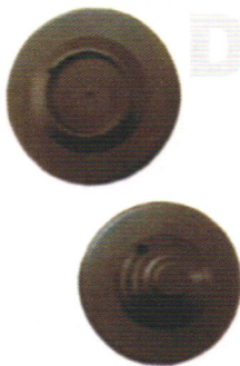
Mini Hard Tag