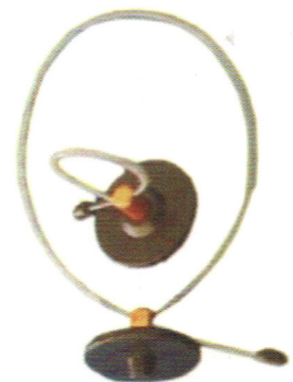
Bottle Safer / Milk Safer