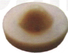
Small Round Hard Tag 8.2MHz